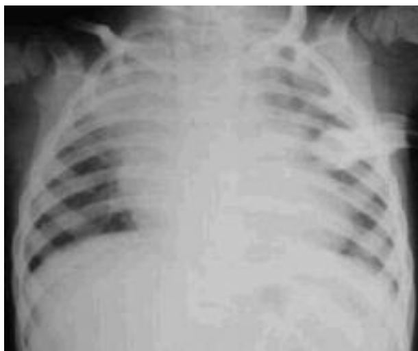
Fig. 2. — Chest radiograph revealing areas of consolidation in the right upper lobe consistent with aspiration.

broad spectrum antibiotics. After the child's condition gradually improved, he was successfully extubated on POD 10 and discharged home.