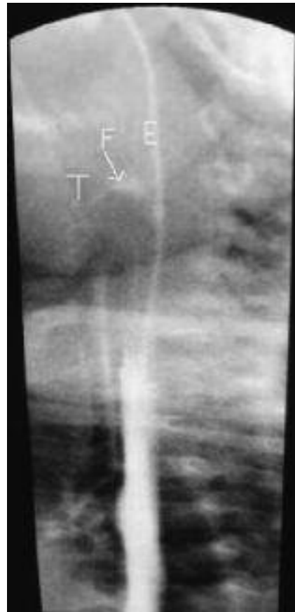
Fig. 1. — An H type tracheoesophageal fistula (F) outlined by contrast during an esophagogram. A small amount of contrast has entered the trachea (T). Esophagus (E).

airway was secured following the administration of 30 mg thiopentone and 10 mg of suxamethonium. As moderate resistance was encountered while intubating with a 4 mm ID ETT, the use of a 3.5 mm ID ETT was necessary. Suctioning of the ETT was done and the child was stabilized. Subsequently dexamethasone was given and sedation was provided with midazolam. Chest radiograph revealed evidence of aspiration (Fig. 2). The child was given a trial of extubation on POD 2, but had to be reintubated due to recurrent stridor. At this time a flexible bronchoscopic examination was performed with topical anesthesia using 4% lignocaine, and sedation with fentanyl and midazolam. It revealed significant edema below the glottis. Trauma of the airway either resulting from intubation and tube manipulation causes stridor and the presence of subglottic edema is usual in such cases. The use of appropriately sized endotracheal tubes and assurance of a leak below 30 cm \text{H}_2\text{O} pressure decreases the risk of airway trauma. A repeat extubation trial on day also 4 failed. Subsequently the child developed pneumonia and was treated with