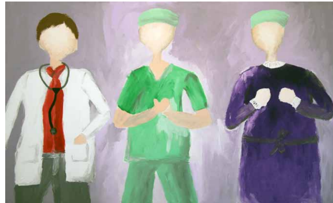
Visibility of the department of anesthesia. Announcement of the inquiry "who is your anesthesiologist?"

By attending the meeting and/or exhibition organised in conjunction with the meeting, participants and exhibitors agree that neither the Organising Committee nor the Administrative Secretariat assume any liability, participants and exhibitors are advised to organise their own insurances.